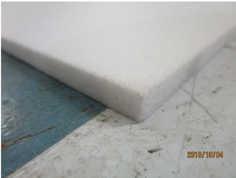
Figure 2 – Detail of specimen material